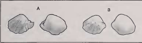
Fig. 5. Left lapillus of A) Galeichthys trowi sp. nov., and B) G. feliceps , lateral and mesial surfaces.